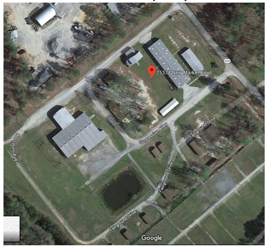
NO OVERNIGHT PARKING

It is NOT appropriate to visit the trial location prior to the trial date. Many search locations are real-life environments and such visits may risk the host losing the opportunity to use the location in the future.